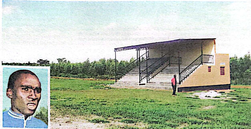
Little progress. So far only a pavilion and a pit latrine have been constructed at the site for interim use even after more than Shs600m has been released for the works. Inset is John Akii-Bua.

going to do delegated work on behalf of the ministry. So, Lira District local government was supported to start the preliminary work. This preliminary work included landscape preparation, drainage system, road networking and tree removal."