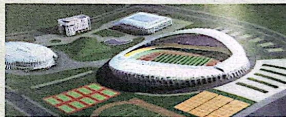
New. An architectural model of the proposed Akii-Bua stadium.

John Akii-Bua was a Ugandan athlete and the first Olympic champion from the country in the 1972 - 400m hurdles. As a police officer, Akii-Bua was promoted by